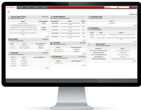
Home page content personalized for optimal efficiency per user.