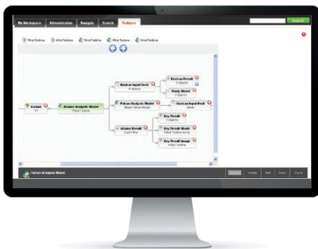
Automated pedigree tracking captures complete data and process trail.

User interface configuration of user access, projects, objects, monitoring, and processes