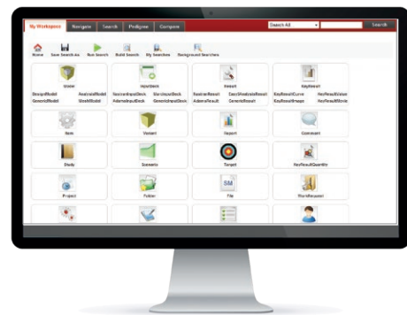
Dedicated Search Workspace provides intuitive filtering for fast down-selection.